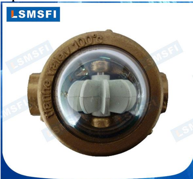
Wenzhou Luosimeng Machinery Co.Ltd.