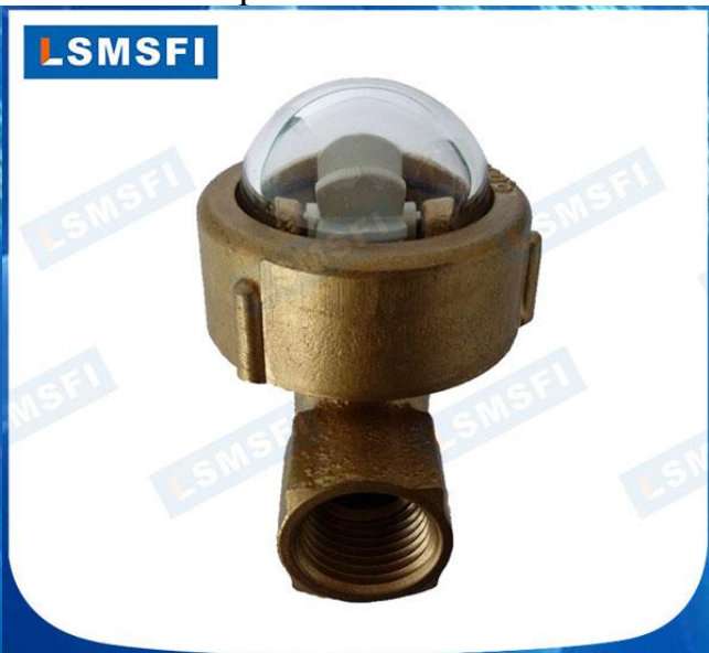
Wenzhou Luosimeng Machinery Co.Ltd.