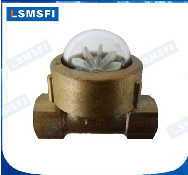
Wenzhou Luosimeng Machinery Co.Ltd.