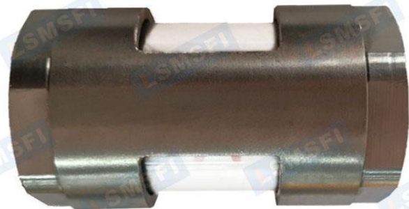
Wenzhou Luosimeng Machinery Co.Ltd.

Wenzhou Luosimeng Machinery Co.,Ltd. (Sight Flow Indicator Manufacturer)