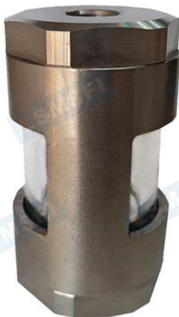
Wenzhou Luosimeng Machinery Co.Ltd.