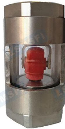
Wenzhou Luosimeng Machinery Co.Ltd.