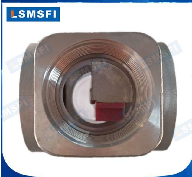
Wenzhou Luosimeng Machinery Co.Ltd.