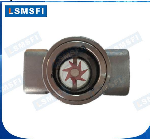
Wenzhou Luosimeng Machinery Co.Ltd.