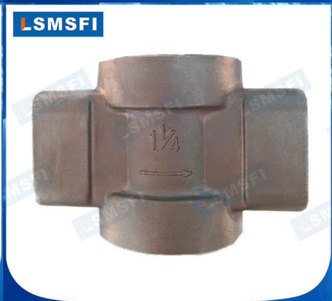
Wenzhou Luosimeng Machinery Co.Ltd.

Wenzhou Luosimeng Machinery Co.,Ltd. (Sight Flow Indicator Manufacturer)