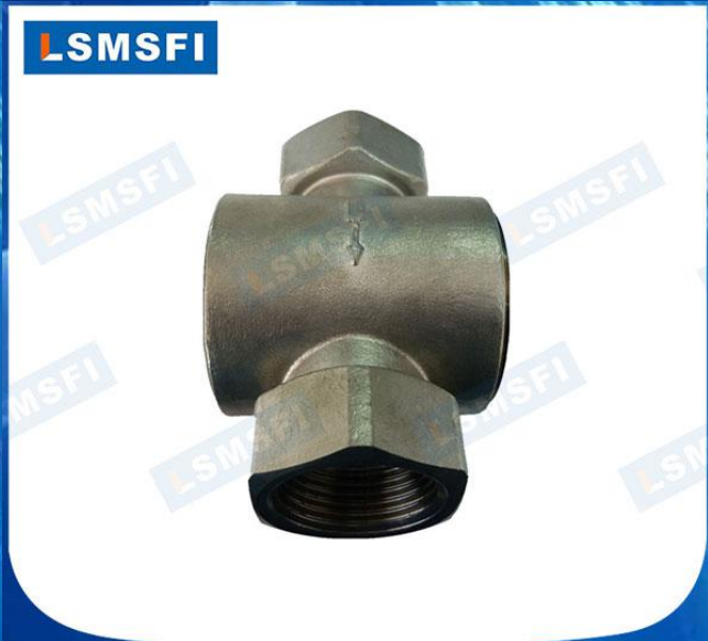
Wenzhou Luosimeng Machinery Co.Ltd.

Wenzhou Luosimeng Machinery Co.,Ltd. (Sight Flow Indicator Manufacturer)