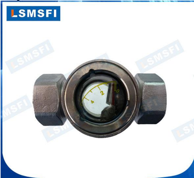
Wenzhou Luosimeng Machinery Co.Ltd.