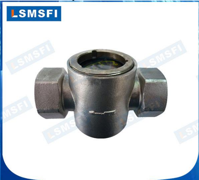
Wenzhou Luosimeng Machinery Co.Ltd.