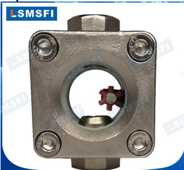
Wenzhou Luosimeng Machinery Co.Ltd.