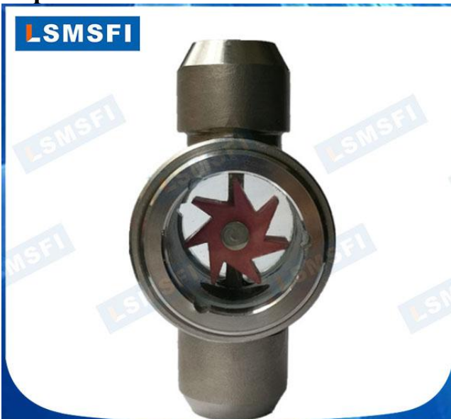
Wenzhou Luosimeng Machinery Co.Ltd.