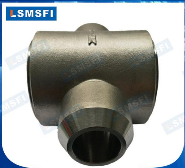
Wenzhou Luosimeng Machinery Co.Ltd.

Wenzhou Luosimeng Machinery Co.,Ltd. (Sight Flow Indicator Manufacturer)