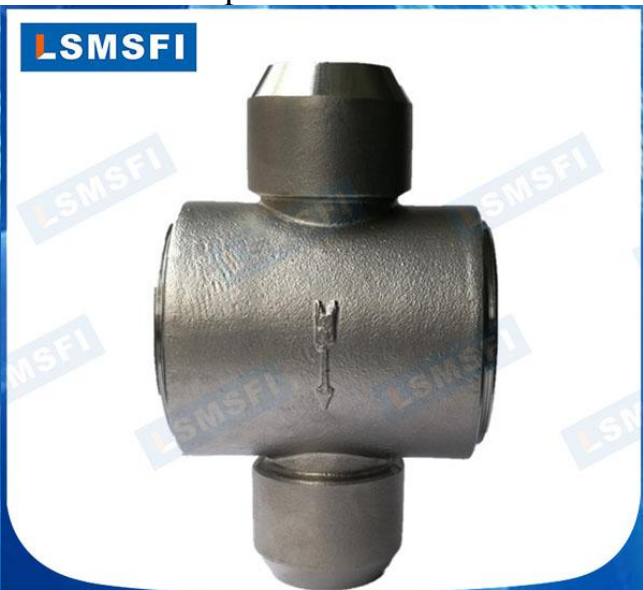
Wenzhou Luosimeng Machinery Co.Ltd.